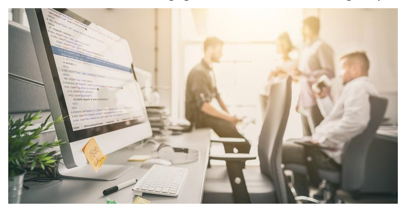
Website development tips from Sam Nishanth

No matter how much time and money you spent developing your website, the site is only successful if users spend time there and engage with the content. High website user engagement results in higher conversions and more return visits.